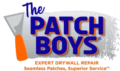
MAJA SHOLLER THE PATCH BOYS